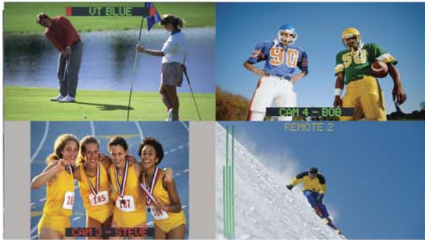
VxV-4HD QUAD SPLIT 16:9