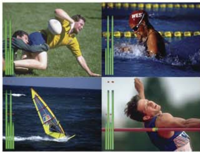
VxV-4HD QUAD SPLIT 4:3